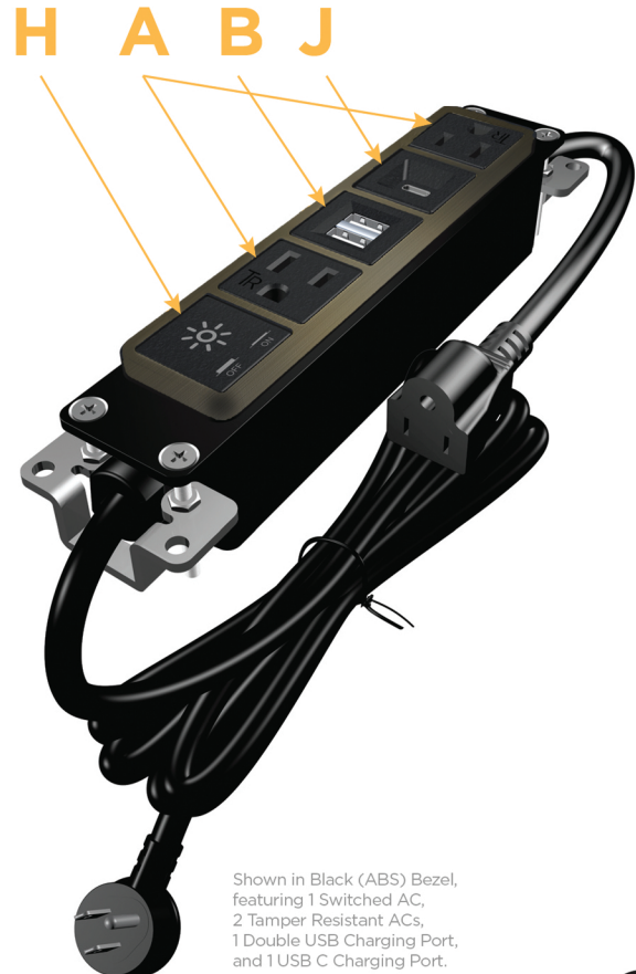
Shown in Black (ABS) Bezel, featuring 1 Switched AC, 2 Tamper Resistant ACs, 1 Double USB Charging Port, and 1 USB C Charging Port.