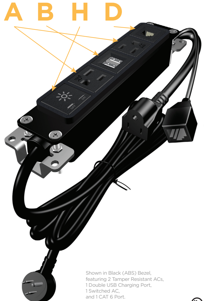
Shown in Black (ABS) Bezel, featuring 2 Tamper Resistant ACs, 1 Double USB Charging Port, 1 Switched AC, and 1 CAT 6 Port.