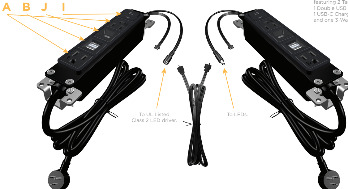
Shown in Black (ABS) Bezel, featuring 2 Tamper Resistant ACs, 1 Double USB Charging Port, 1 USB-C Charging Port, and one 3-Way Switch.