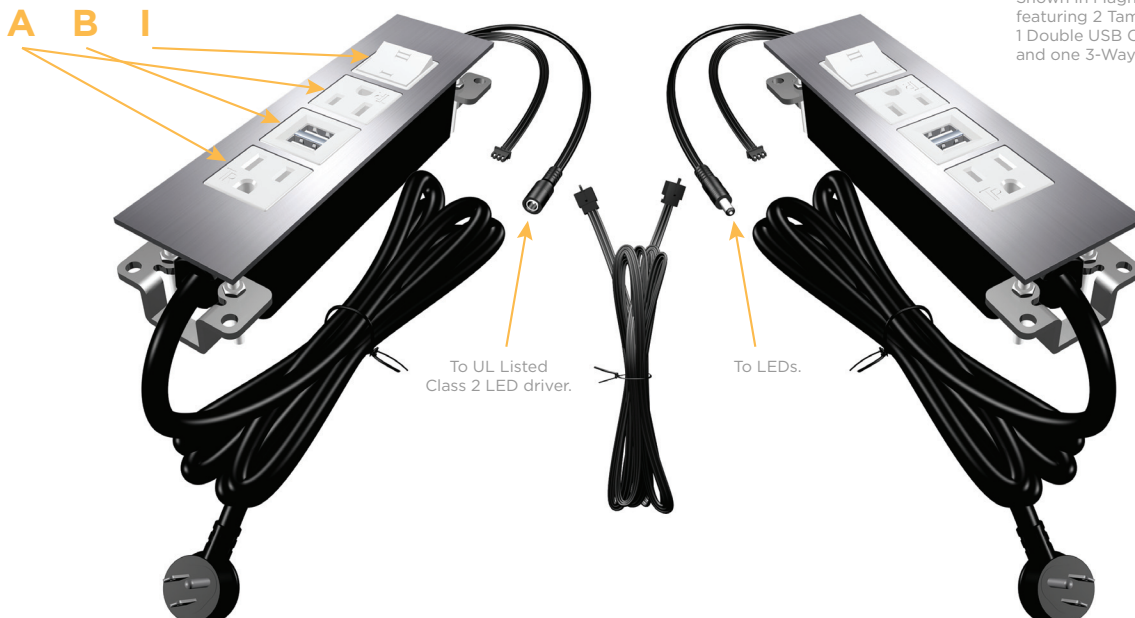
Shown in Magnesium (ABS) Trim Plate, featuring 2 Tamper Resistant ACs, 1 Double USB Charging Port, and one 3-Way Switch.