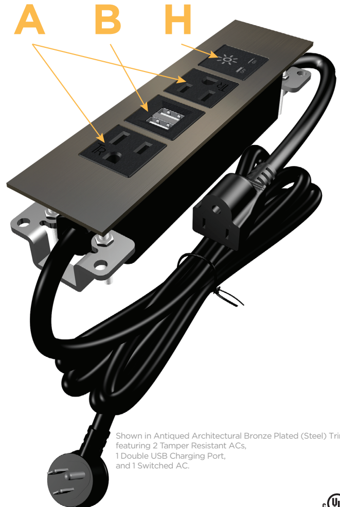
Shown in Antiqued Architectural Bronze Plated (Steel) Trim Plate, featuring 2 Tamper Resistant ACs, 1 Double USB Charging Port, and 1 Switched AC.