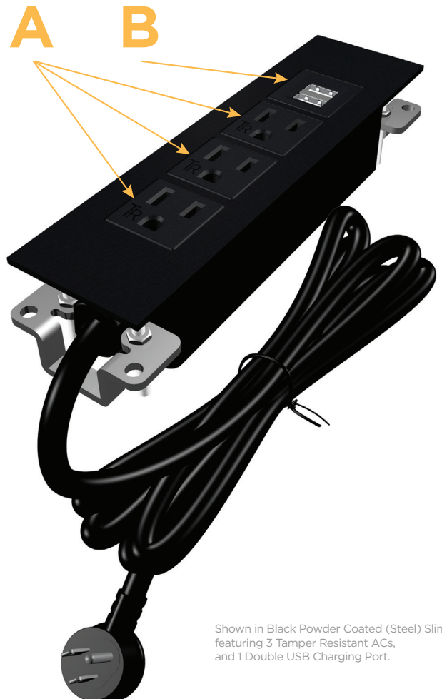
Shown in Black Powder Coated (Steel) Slim Plate, featuring 3 Tamper Resistant ACs, and 1 Double USB Charging Port.