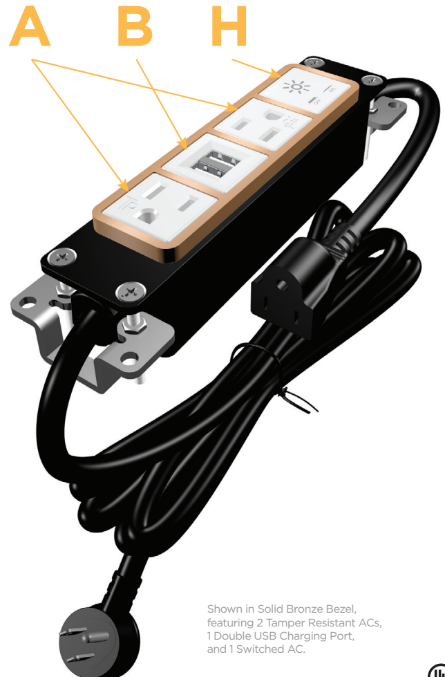
Shown in Solid Bronze Bezel, featuring 2 Tamper Resistant ACs, 1 Double USB Charging Port, and 1 Switched AC.