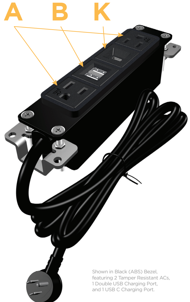
Shown in Black (ABS) Bezel, featuring 2 Tamper Resistant ACs, 1 Double USB Charging Port, and 1 USB C Charging Port.