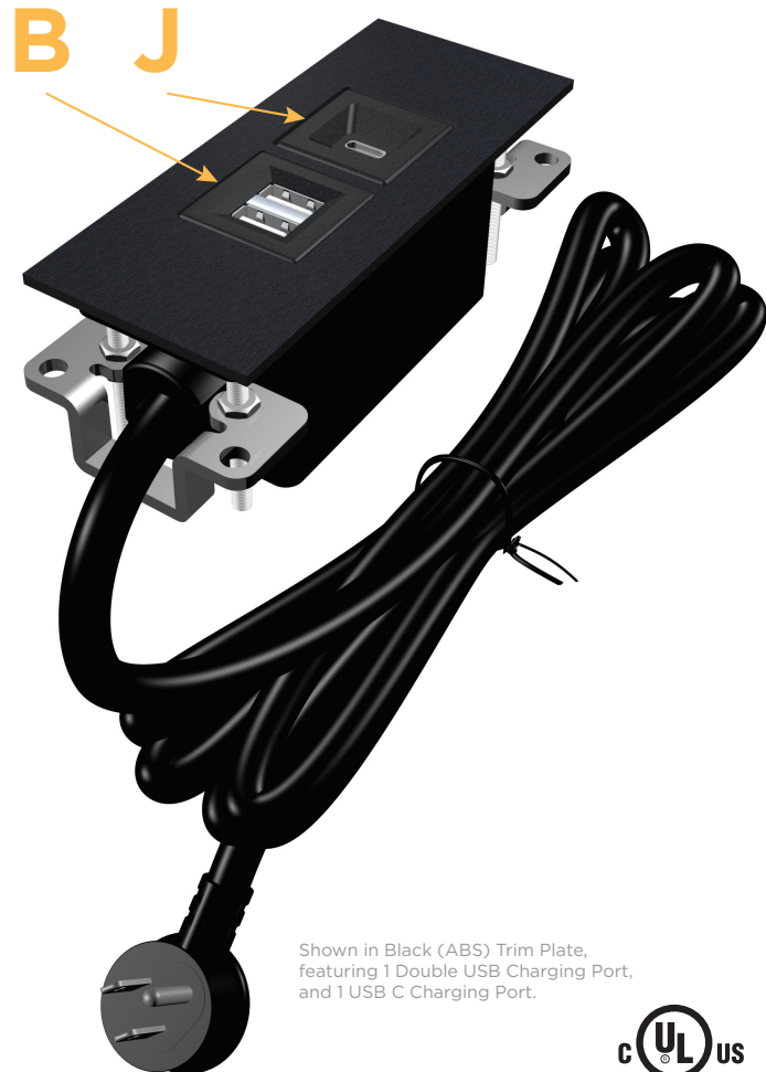
Shown in Black (ABS) Trim Plate, featuring 1 Double USB Charging Port, and 1 USB C Charging Port.