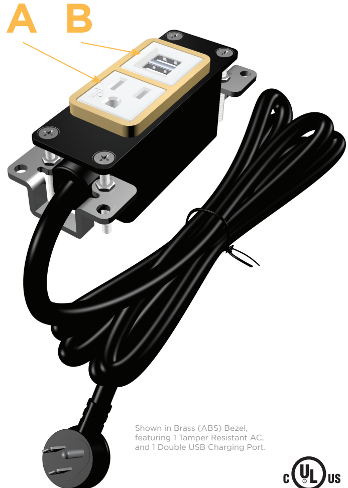
Shown in Brass (ABS) Bezel, featuring 1 Tamper Resistant AC, and 1 Double USB Charging Port.