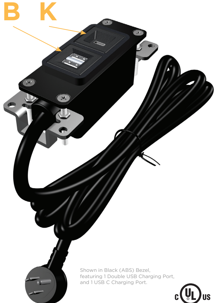
Shown in Black (ABS) Bezel, featuring 1 Double USB Charging Port, and 1 USB C Charging Port.