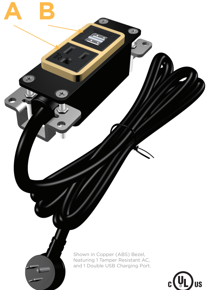
Shown in Copper (ABS) Bezel, featuring 1 Tamper Resistant AC, and 1 Double USB Charging Port.