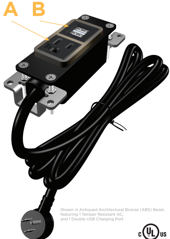
Shown in Antiqued Architectural Bronze (ABS) Bezel, featuring 1 Tamper Resistant AC, and 1 Double USB Charging Port.