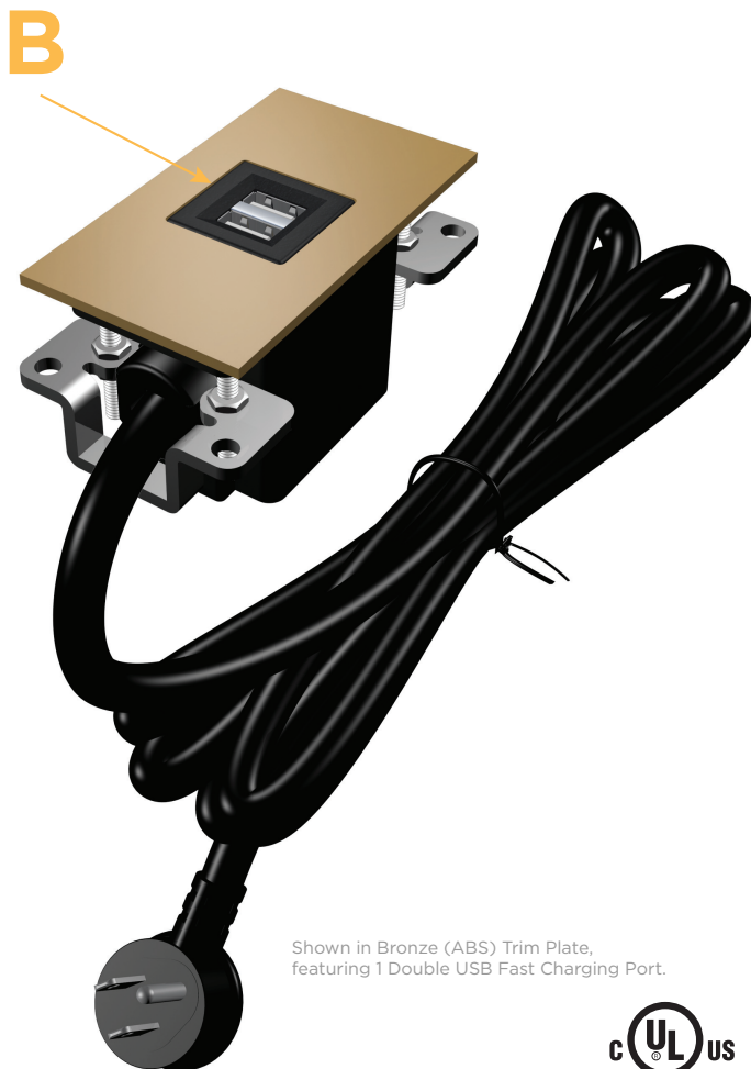
Shown in Bronze (ABS) Trim Plate, featuring 1 Double USB Fast Charging Port.