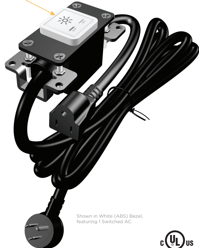
Shown in White (ABS) Bezel, featuring 1 Switched AC.