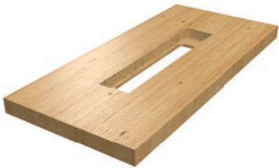
CUT HOLE IN BOTTOM