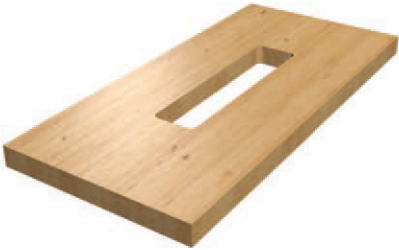
CUT HOLE IN BOTTOM

914-699-0101 sales@mormax.com mormax.com